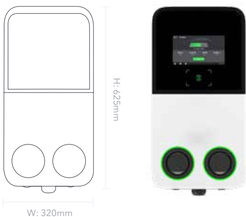
WALL MOUNTED FRONT VIEW